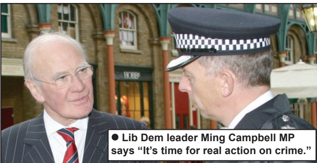
● Lib Dem leader Ming Campbell MP says "It's time for real action on crime."

Ming Campbell's Lib Dems recently unveiled tough new policies on sentencing.