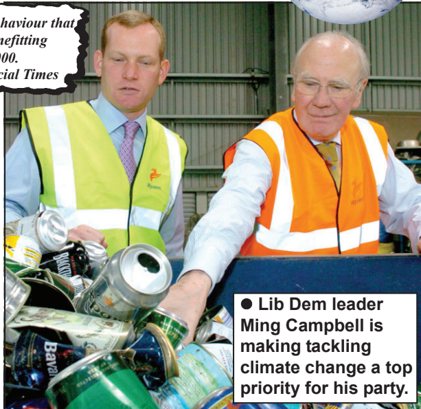
● Lib Dem leader Ming Campbell is making tackling climate change a top priority for his party.